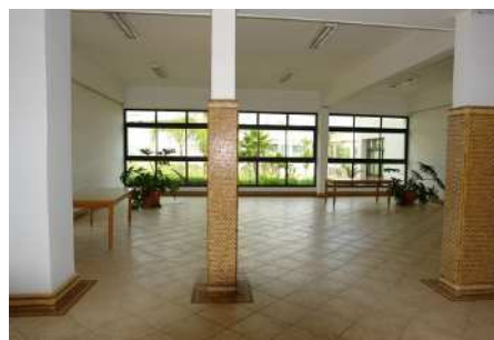
Part of the IEA Exhibitors area

Please email to leljirari@onep.org.ma for more information about the conditions for participation.