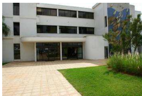
Conference Centre IEA, Rabat

The 3 rd ACWUA Best Practice Conference and Exhibition: Non Revenue Water Management in the Arab Region is to be held on 20 - 21 January 2010 at the Conference Centre of ONEP-IEA in Rabat, Morocco.